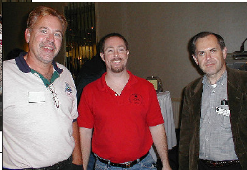
SMCers, WB9Z, K9PG, and N9KO