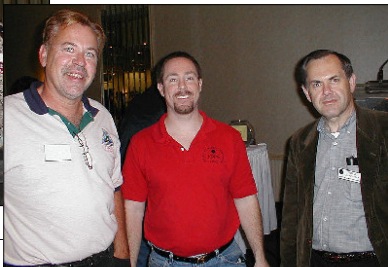
SMCers, WB9Z, K9PG, and N9KO