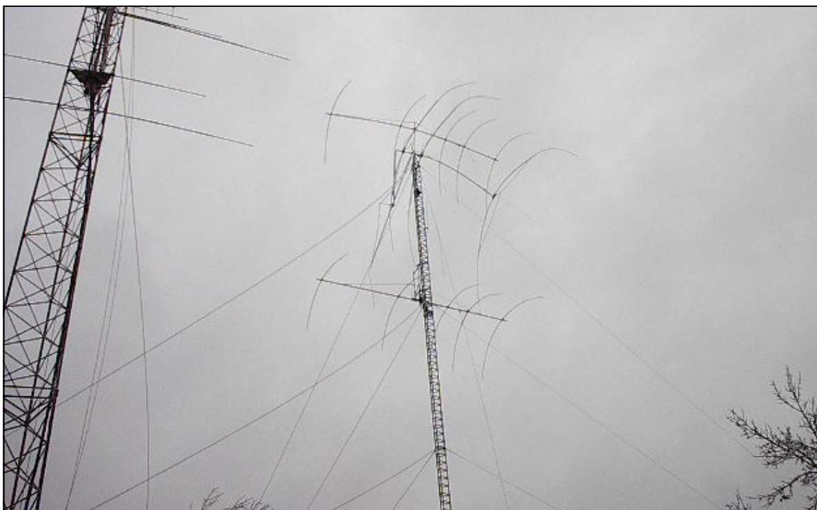
N9RV after ....