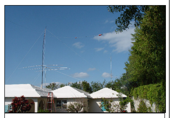
View from the side of the house looking west.

My son's house is approximately <sup>1</sup>/<sub>4</sub> mile from the ocean. The house is on a hill about 30 feet high that falls off to the south. The 80 meter inv vee is oriented east and west, end on to the US. Normally this would be bad, but due to the slope of the lot the house sits on, the west end of the antenna slopes down at a sharp angle, which I believe favors radiation to the west. In fact I might do the best on a comparative basis on 80. While running stations on 80 at the beginning of the contest, my first Californian called me 30 minutes before California sunset followed by a New Mexico station. The 160/40 meter antenna is an inv vee that is ori-