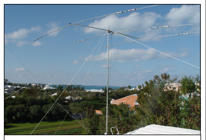
Looking just south of west from the roof top. Note the beam orientation toward the central US.

Before the contest started I got signal comparisons between the CP6 vertical and the A3S beam. I averaged about 2 S units better with the beam. Yesss!!! I was ready to kick butt!