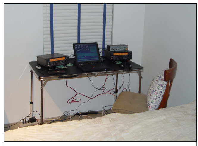
The operating position for VP9/K9CC. Contrast this to the PJ2T picture in the last issue of the Black Hole. Especially since the second radio was only a spare

put a screw clamp at the bottom of each section after pushing it up. I found that in wind and rain the sections will collapse otherwise. Since the dipoles are in inverted vee configuration, there is a lot of down force on the mast. The mast for the Cushcraft A3S beam is another push up mast consisting of three pieces of slip fit aluminum tubing/pipe that totals about 17 feet when raised. The sections are drilled and a pin inserted after raising each section. The beam is fixed on the central USA.