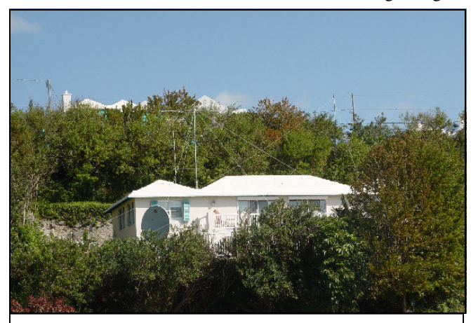
View from road at base of hill, south of the house.

My "target" is VP9/W6PH, since he is on the same island about 2 miles away, and his scores are higher then mine. It is important to compare to another VP9 instead of a station in the Caribbean, due to the propagation differences. From VP9 we have an advantage on 160, but don't do as well on 10 and maybe15. Kurt is a retired airline pilot who operates from VP9GE's "bed and breakfast". Kurt's advantage is that VP9GE is a little closer to the ocean on a hill dropping off toward the ocean, with a great view of the ocean looking towards the USA. Also there is more room for a 160 meter antenna, and the tribander is an A4S with an extra element compared to my A3S. At my location there is a slight hill between me and the ocean. Kurt's disadvantage is that he doesn't get all that good exercise putting up and taking down the antennas. Kurt is a good guy who has even sent me his rate sheets to see if I can pick up any pointers as to what bands to be on at what time. It's beginning to