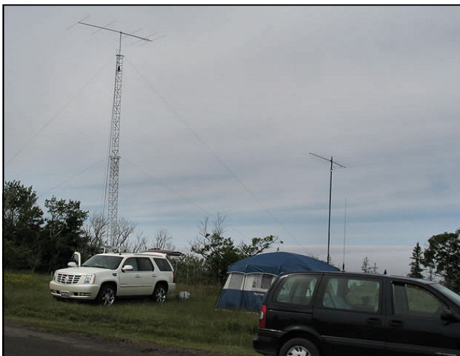
M2 5 el six meter beam on portable, crank-up tower and 10 el 2 meter beam on a mast.

K9CT Craig and Larry N9LR fellow SMCers from Central Illinois spent July 20 and 21st on top of Mt Brockway in EN67 for the CQVHFWW contest. We operated 6 and 2 meters running a ICOM 756Pro III on 6 and a Yaesu FT847 and a brick on 2. Our antennas were a M2 5 element Yagi on 6 and a 10 element Yagi on 2. The most recognizable