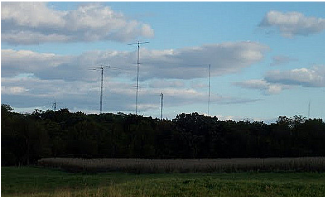
The K4VX antenna farm