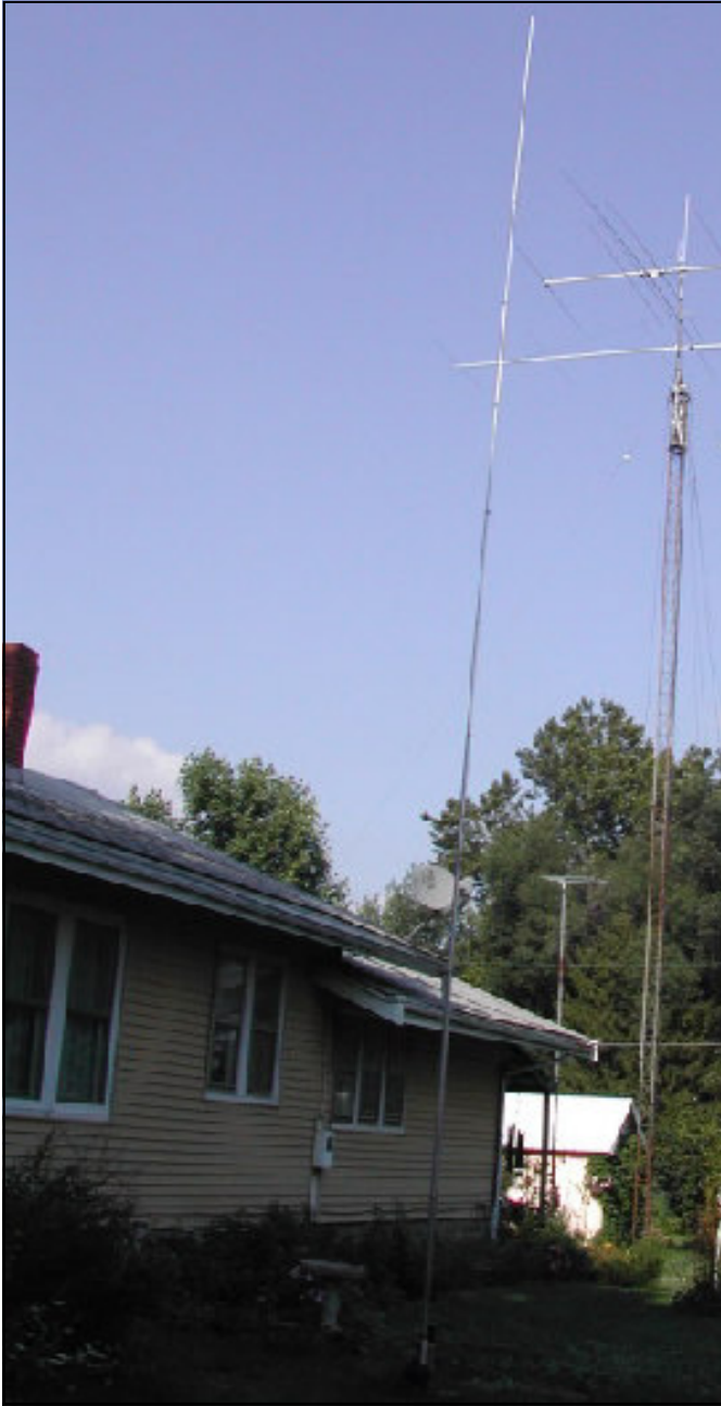
ZeroFive 1/4 wave heavy duty vertical for 40mtrs

cal. Well, not counting the Arrow dual band J pole. I do not have room to put radials equally in all directions, so I did what I could. Shaved the lawn down and put in twenty 32ft radials east and west. I will add a bunch of shorter