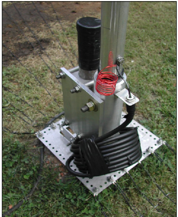
Vertical feed point, including choke to prevent RFI

In the back yard is a Rohn 25 tower. About 58ft tall. With an H4 Hazer on it. Top of the 2 inch mast is about 70 feet. This is the same tower and Hazer that some of you