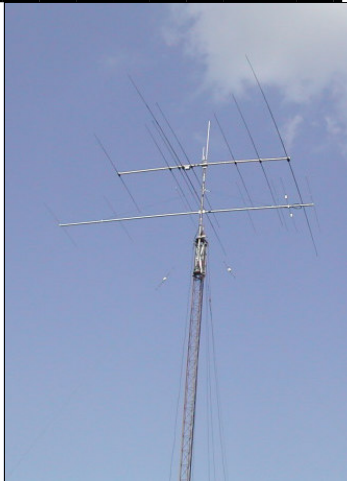
58 foot Rohn 25 tower with an H4 Hazer; the 2 inch mast is about 70 feet. It supports a Force 12 C3E and a M2 6M7.