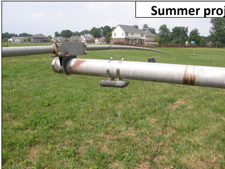
This is a skin diving weigh, which is easily adjustable along the