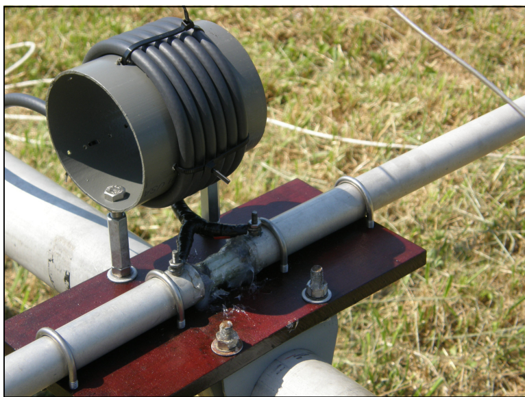
This is the coaxial balun and split direct feed.

So I have been pretty busy antenna wise this summer. If I get to it I am going to try another 15 meter low stack for the domestic contests; in my main stack I can only point the top antenna (160') to the west and this seems to be too high.